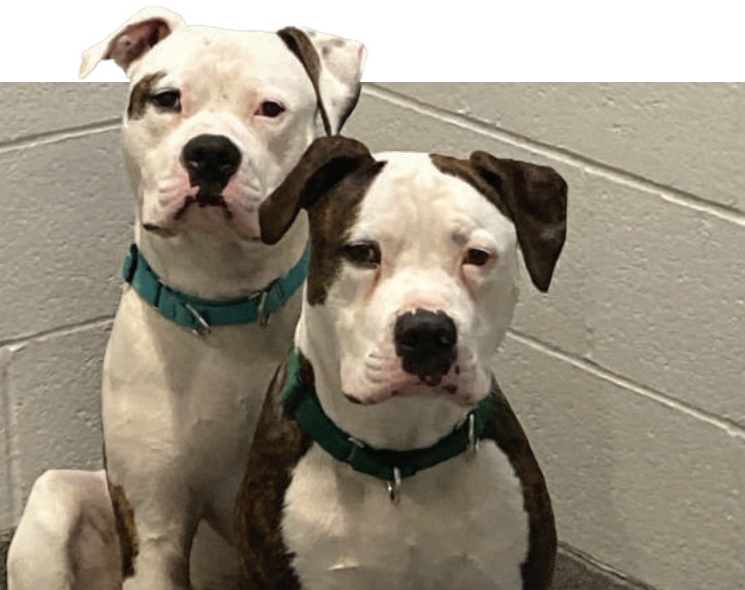
Brothers waiting to get adopted!