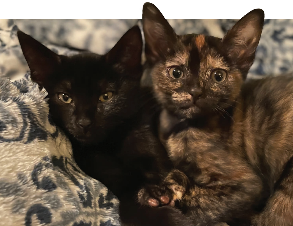
Kitten siblings Ember and Nova cuddling, waiting to be adopted!