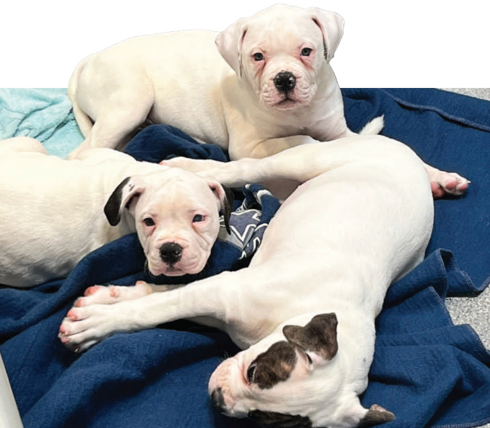
Puppy siblings Gilligan, Mary Ann and Ginger waiting to be adopted!