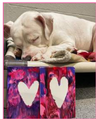
One-of-a-kind painting made with love by a shelter pet