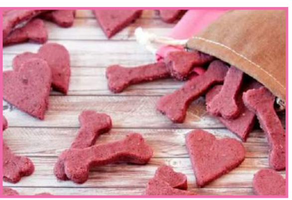
Goodie Bag Valentine for your friend/family AND for their pet (dog or cat specific)