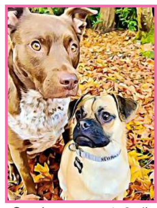
Send a custom 4x6 oil painting print of your fellow animal lover's pet