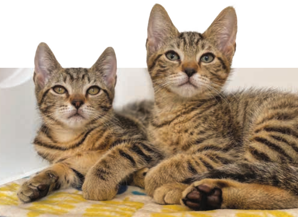
From nap-time to play-time, these siblings patiently awaited their adoption this kitten season!