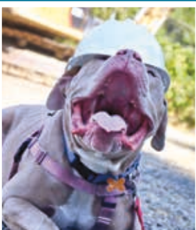
ON THE COVER: Butters

VISIT US ONLINE! kitsap-humane.org @kitsaphumanesociety